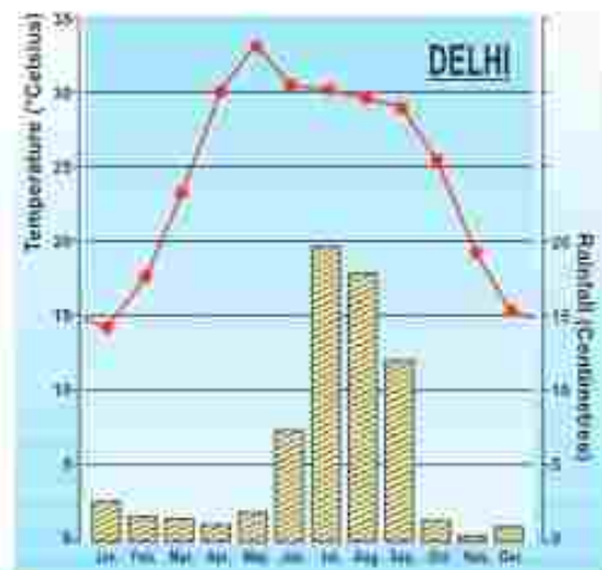
Figure 1 : Temperature and Rainfall of Delhi