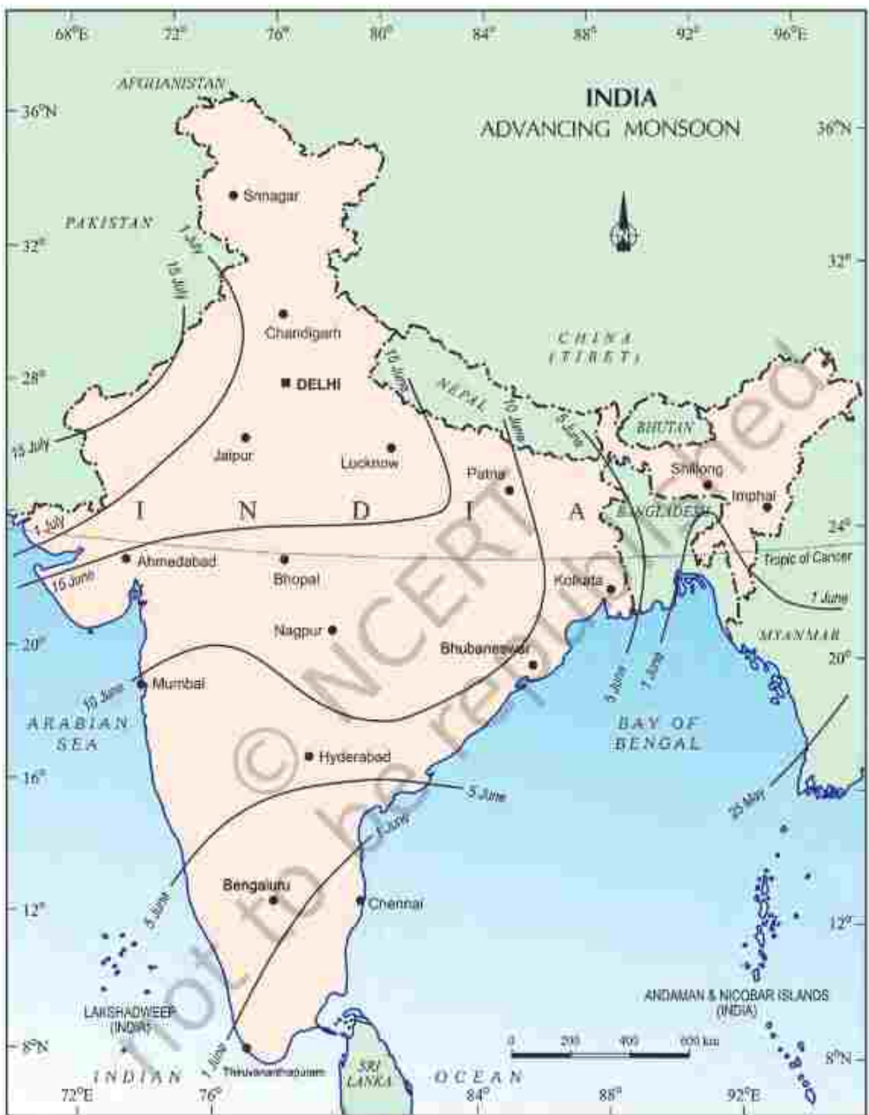
Figure 4.1 : Advancing Monsoon