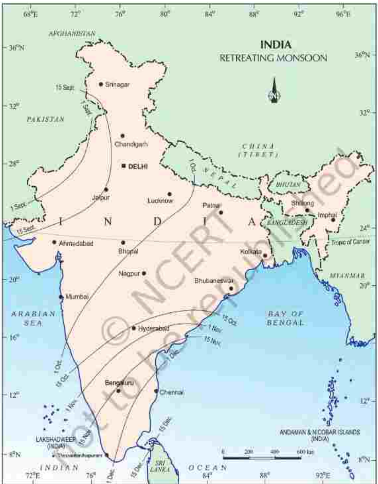
Figure 4.2 : Retreating Monsoon